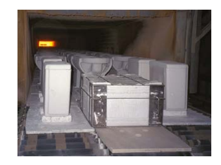
Kiln Tracker system in roller hearth sanitaryware kiln