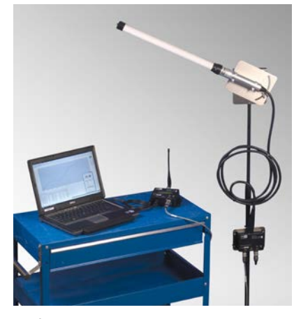
TM21 Radio telemetry system