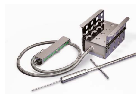
Thermal barrier with 'in kiln' antenna