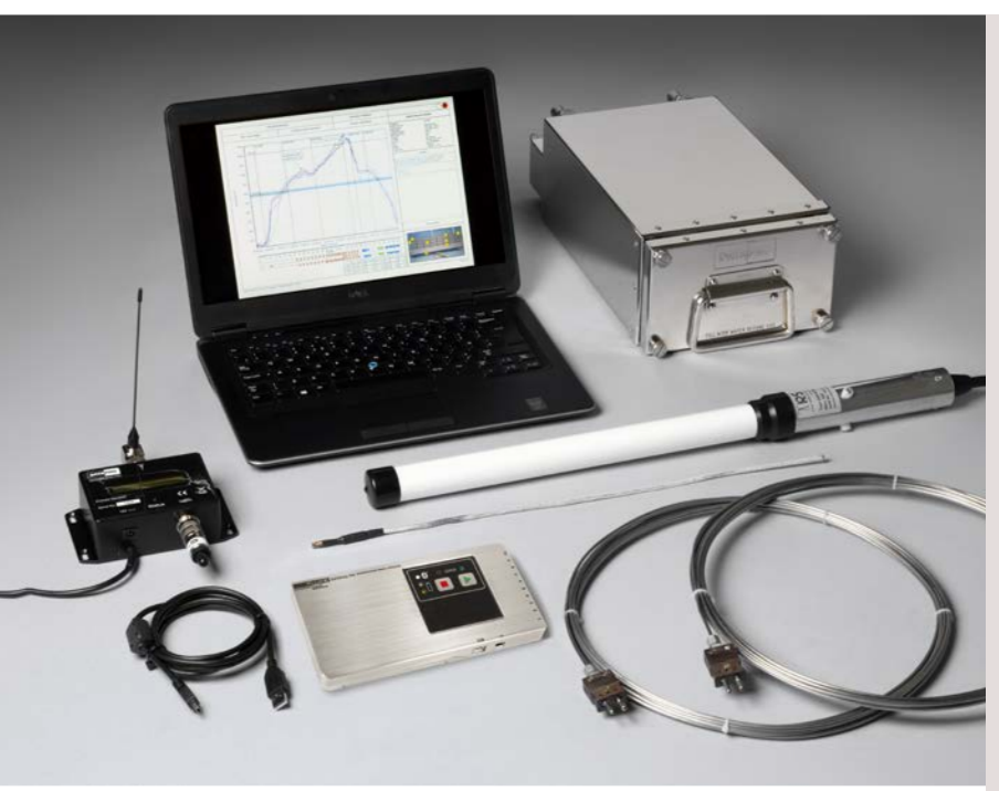
Kiln Tracker system with TM21 radio telemetry system