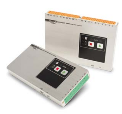
10 and 20 channel case style options to suit barrier design